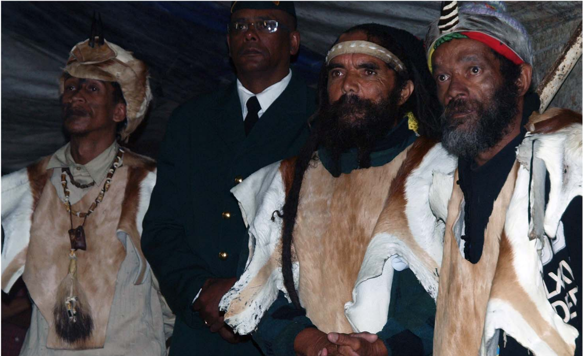
Different tribal members and other dignitaries witness the //Nâu Ceremony at Oude-Molen in Pinelands.